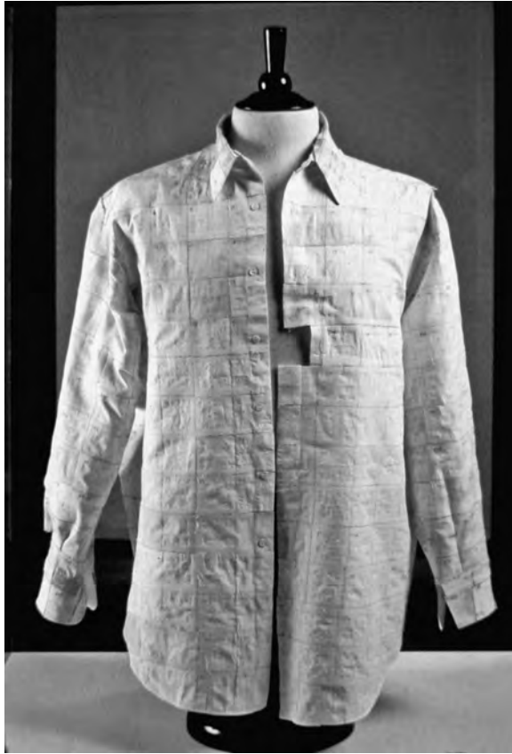
FIGURE 2.1 Charles LaBelle, Disappearance—Shirt That Passed Through My Body , 1998–1999 ( men's dress shirt [size 40 regular] and iron-on mending tape ).

When I eat, the gluttonous void of the bottom of the throat, of the greedy orifice, summons the alimentary bolus to monopolize it to the detriment of the teeth and the tongue, with which the uvula from behind has strange complicities. But all that is of no interest of any kind, for the tongue, is an obscene hooker who in front is ready to follow the teeth in their detailed work of mastication, and behind, even more ready to let herself be gobbled by the orifice, and to push lewdly and treacherously food toward the orifice. 7