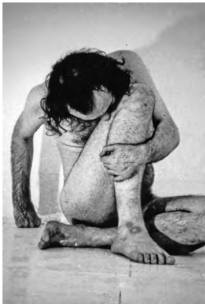
FIGURE 1.1 Vito Acconci, Trademarks , 1970 (photographed activity, ink prints).