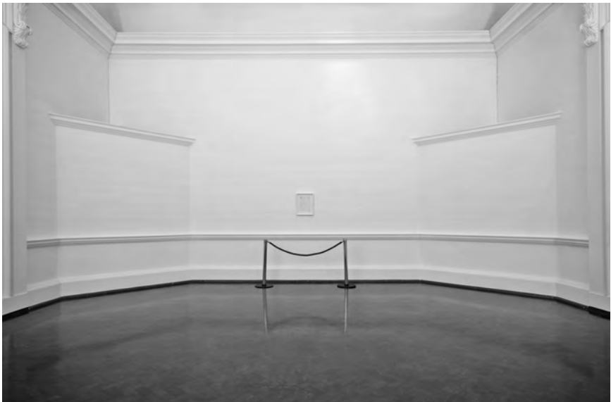
FIGURE 3.1 James Webb, Scream (Guernica), 2008. Installation view, with certificate of permission from the Reina Sofia Museum, plus audio recording amplified from concealed speakers, “MMXII” exhibition, the Johannesburg Art Gallery, 2012.

and articulation; while the scream is captured in such blood-curdling films as Halloween , Texas Chainsaw Massacre , and Nightmare on Elm Street —as a gaping mouth that expresses the core of horror in general, and that appears in all such horror films—it finds more considered expression in the project of artist James Webb, titled Scream (Guernica) (2008). Webb’s screaming work additionally locates us within processes of national protest and history, in this instance in Madrid, at the Reina Sofia Museum, giving way to a sense for the emotionality so central to voicing. For the work, the artist recorded members of the museum staff screaming in front of Picasso’s painting Guernica . If the scream can be thought of as that “presymbolic manifestation of the voice,” 28 here it aims itself at the artwork to force a tension between the image and the brutality it seeks to depict. The scream is mobilized as a means to unsettle the static image through a force of voice and its extreme audibility—to draw out its history in relation to the present, and to instigate a reflection on today’s political situation. The work sought to utilize the embedded narrative held within the painting, and to animate its historical truth by way of a screaming body, so as to charge the public realm with a particular resonance: a force of angst, want, and desperation (Figure 3.1).