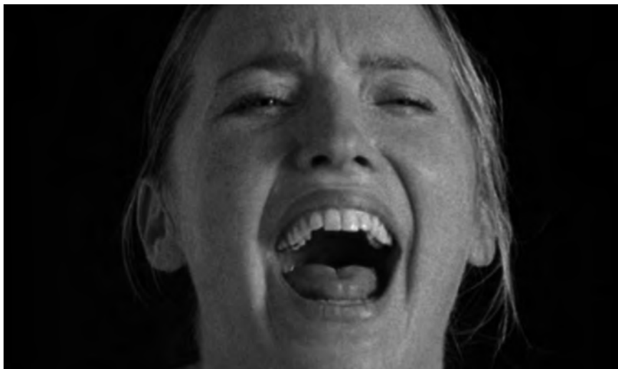
FIGURE 8.1 Sam Taylor-Johnson, Hysteria, 1997. Laser disk, shot on 16 millimeters. Duration: 8 minutes.

performing as a responsive sonority to those around: one continually laughs in dialogue with others, and as part of innumerable situations that punctuate and orchestrate the everyday. This extends particularly through laughter's "contagious" effect, which so immediately takes hold and gives shape to social synchronization. This contagious effect is rendered with great hilarity and madness in the film Mary Poppins , when Uncle Albert and Bert sing together "I Love to Laugh," which causes them to levitate; hovering near the ceiling, their mad-capped laughter eventually spreads even to the children, who join in on the infectious zaniness. The contagion of laughter—also appearing in historical accounts of "laughing epidemics"—leads us into an extremely complex territory. The mouth here is balanced between the socially warranted and the dangers of taboo, between shared languages and the rupture of their rationality. (As Uncle Albert demonstrates, laughter borders on oblivion.) With laughter, the movements of the mouth exceed so many limits, to occupy and break, as well as reaffirm the edges of the social order.